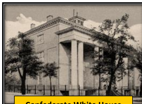
Confederate White House

This is a free event and light refreshments will be served.